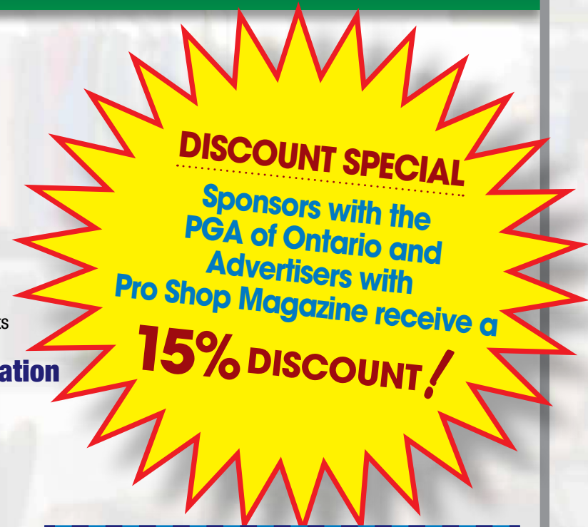
EXHIBIT RATES (taxes extra)